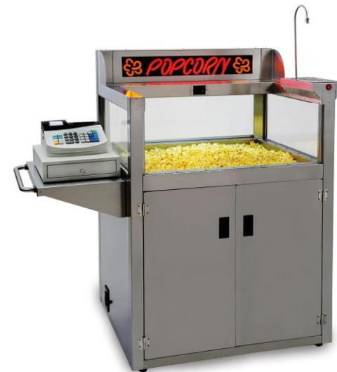
Crisper – Build in Counter