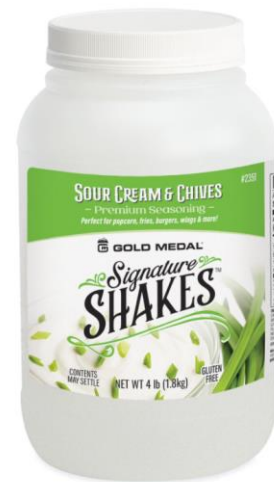
Sour Cream & Chives