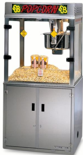
Pop-O-Gold 32-oz. with LED Neon Sign & Base