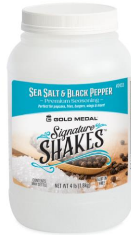
Sea Salt & Black Pepper