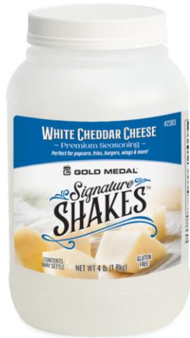
White Cheddar Cheese