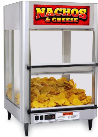
Bulk Nacho Warmer