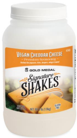
Vegan Cheddar Cheese