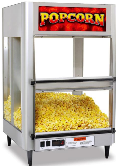
Bulk Popcorn Staging Cabinet