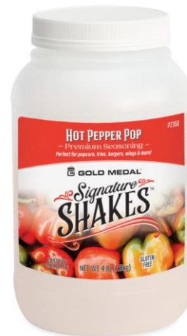
Hot Pepper Pop