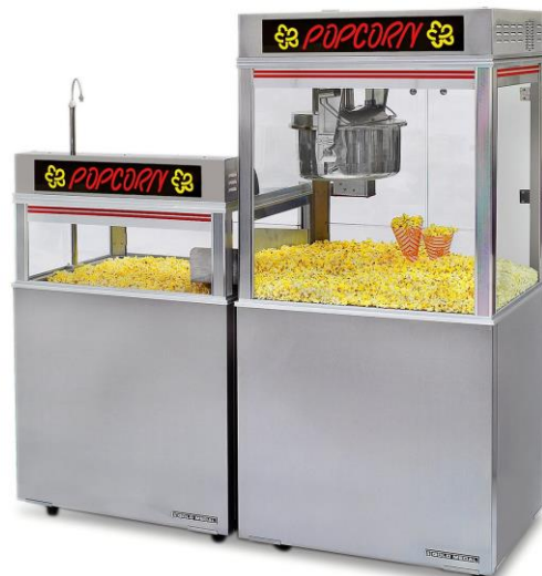
Pop-O-Gold 32-oz. with Chute