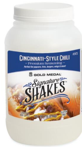
Cincinnati Style Chili