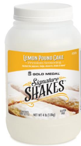
Lemon Pound Cake