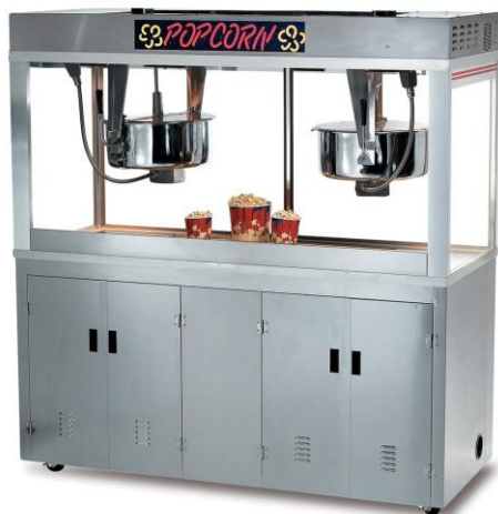
Twin Medallion 52-oz. Popper with LED