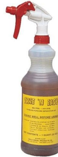
Free N Easy