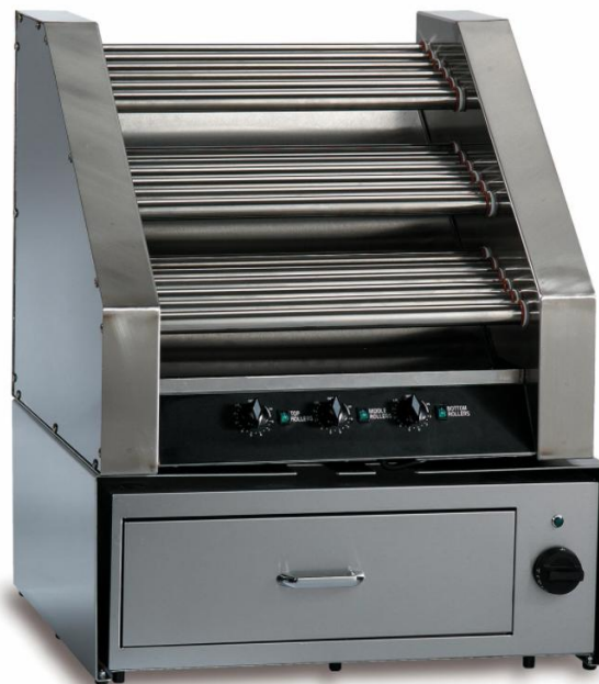
Three-Tier Hot Dog Grill