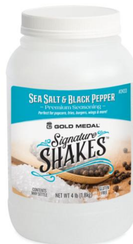
Sea Salt & Black Pepper