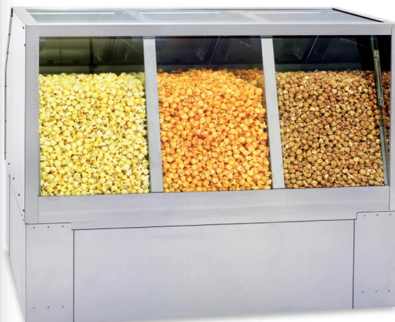
48" Main Street Elite Popcorn Staging Cabinets – Triple Compartment