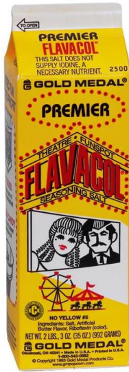
Butter Flavour Salt