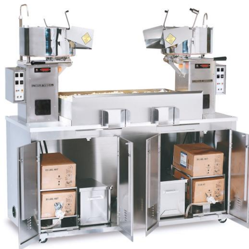
Twin Grand Pop-O-Gold 32-oz. Popper