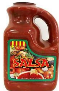
Thick N' Chunky Salsa