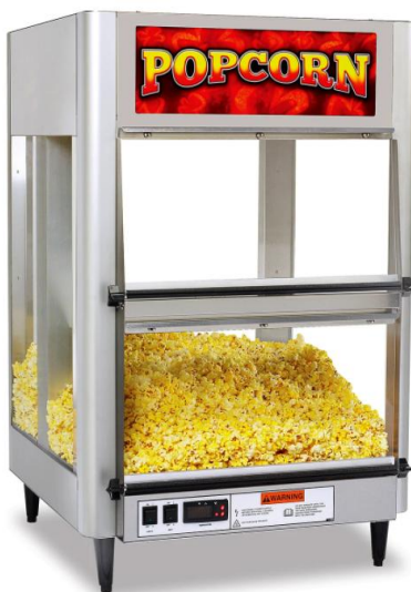
Bulk Popcorn Staging Cabinet