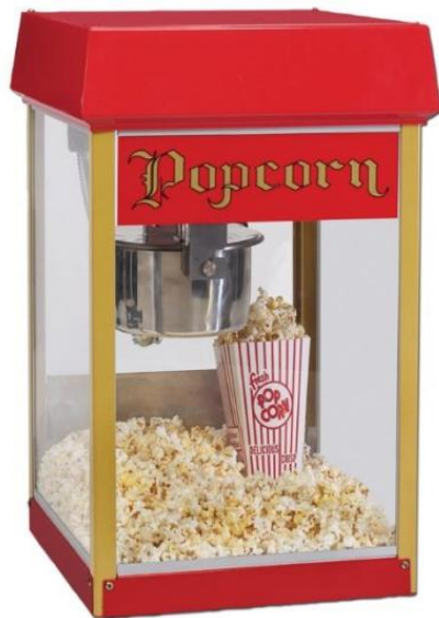
4 Oz Popcorn Machine