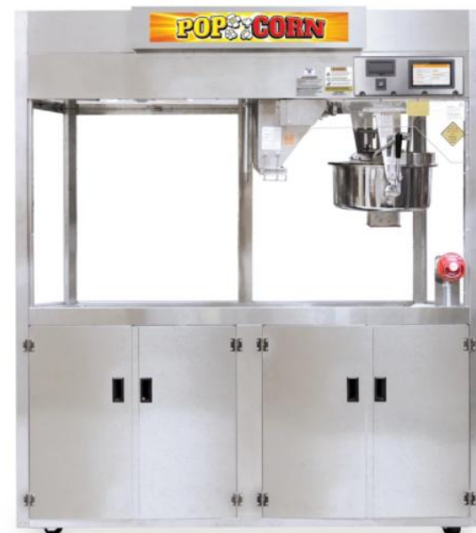
PopClean® Elite Popper® Series with Precision Pop® Technology - Touch Screen Controls