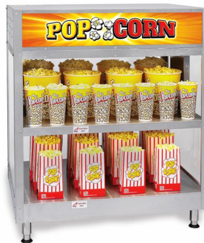
Staging Cabinet (36")