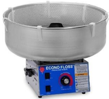
COTTON CANDY MACHINE