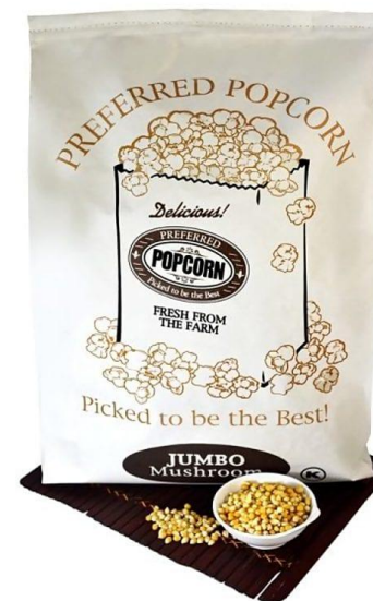
Mushroom Popcorn Seeds