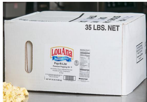
Bag In Box Oil