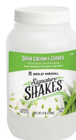
Sour Cream & Chives