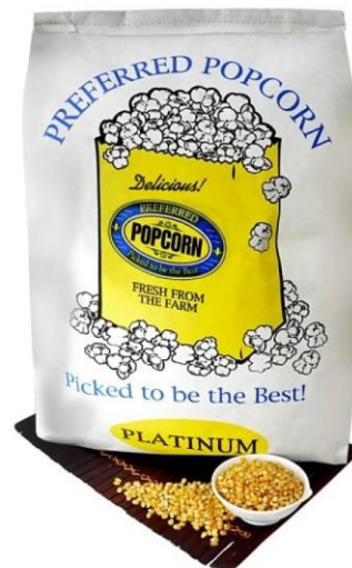
Butterfly Popcorn Seeds