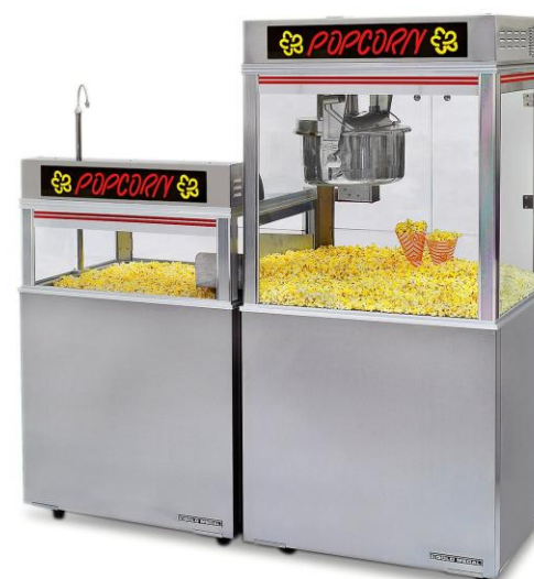
Pop-O-Gold 32-oz. with Chute