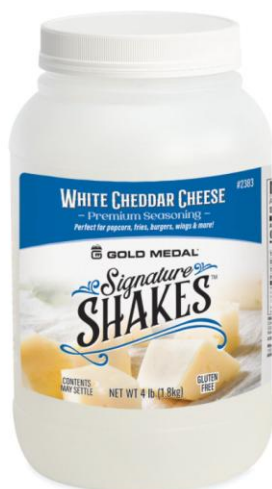
White Cheddar Cheese