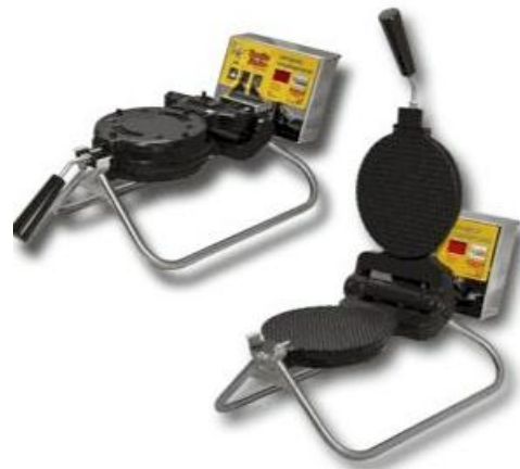
WAFFLE CONE BAKER