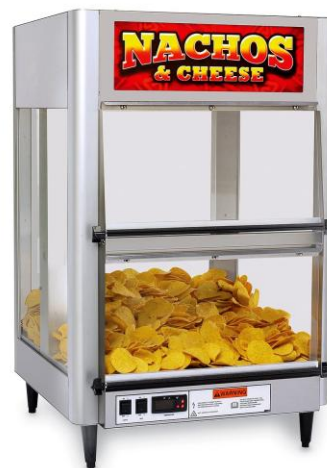
Bulk Nacho Warmer