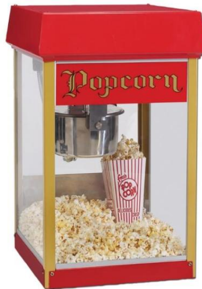
8 Oz Popcorn Machine