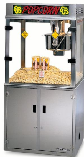
Pop-O-Gold 32-oz. with LED Neon Sign & Base