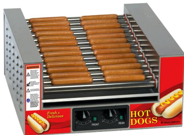
Slanted Hot Diggity® Hot Dog Grill